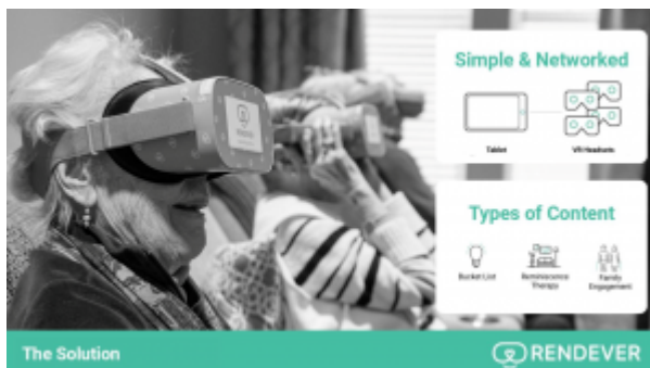
2020 CABHI Pitch Competition

We ended the day with an exciting rapid-fire Pitch Competition. Seven companies presented their innovative aging and brain health solutions to our panel of judges. Congratulations to AudioCardio for winning the 2020 CABHI Innovation Award, and Rendever for winning the People’s Choice Award!